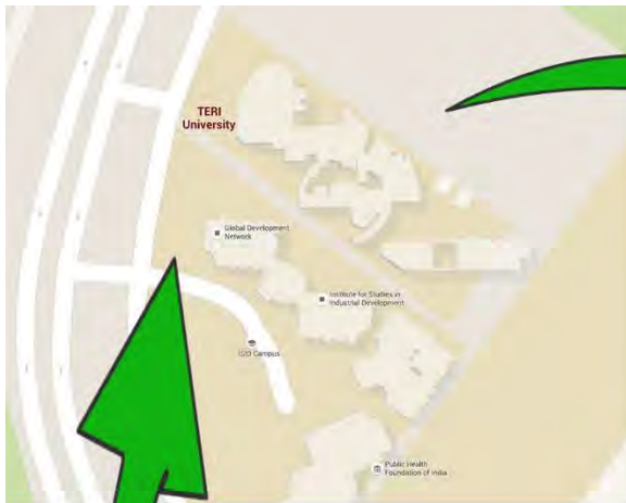
TERI University Location Map